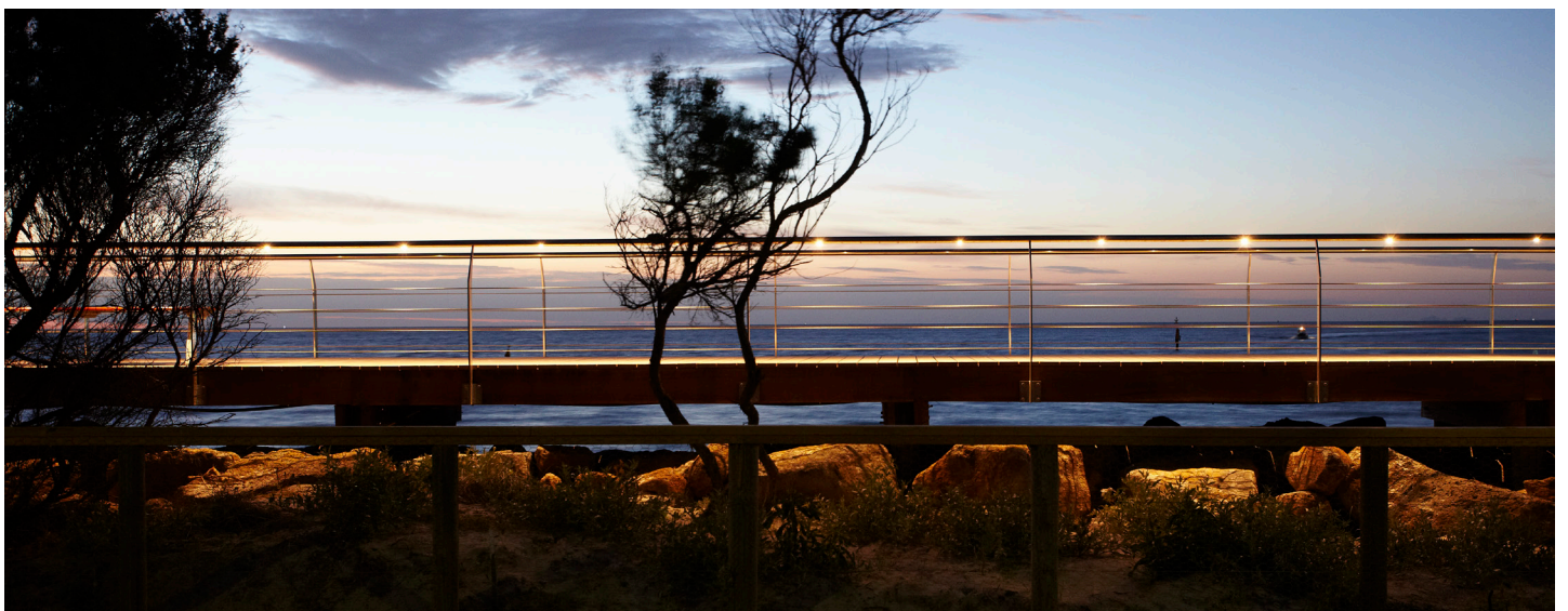
Carrum Foreshore Precinct – Melbourne, VIC · Kingston City Council