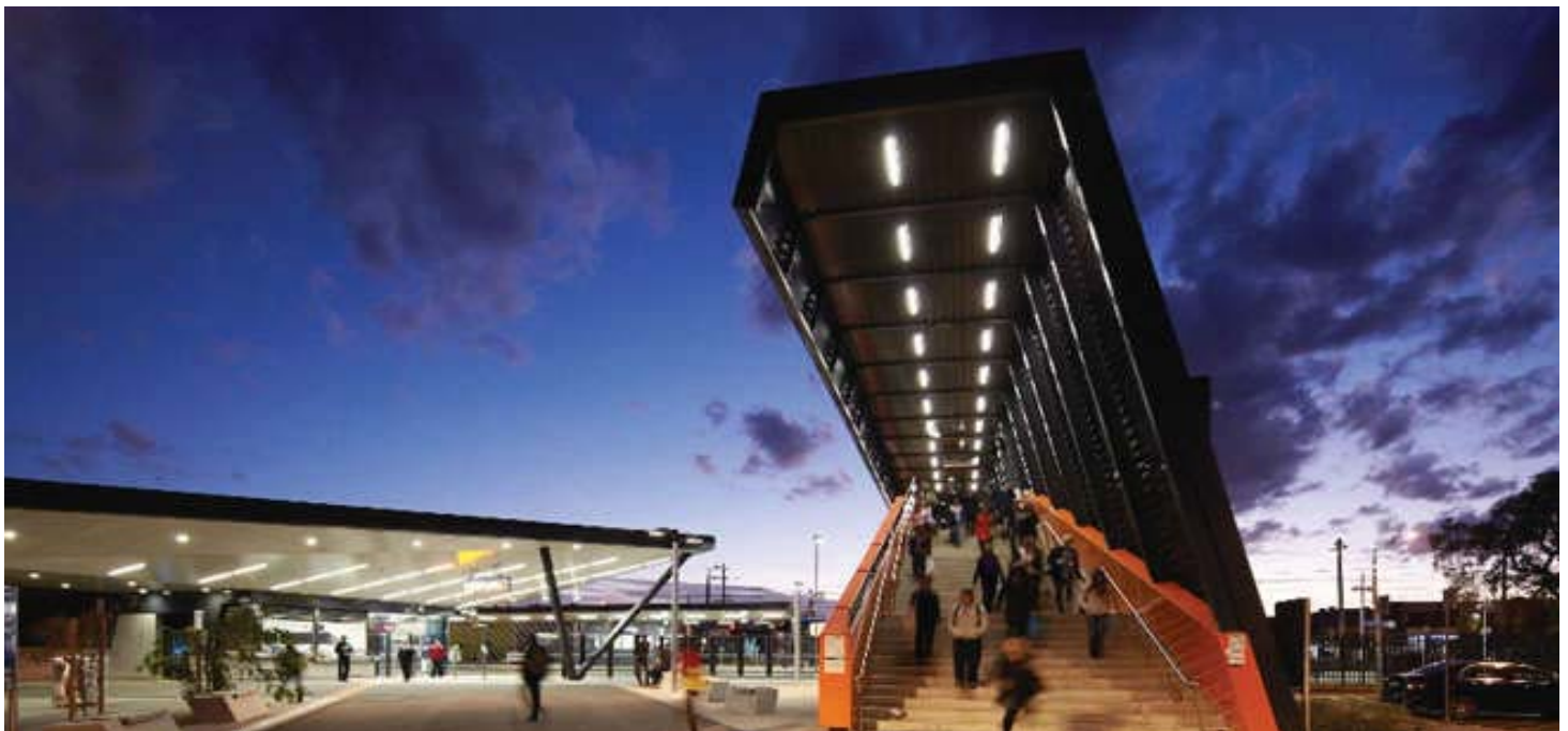
Thomastown Railway Station, Victoria · Architect: Cox Architecture · Lighting Design: Arup